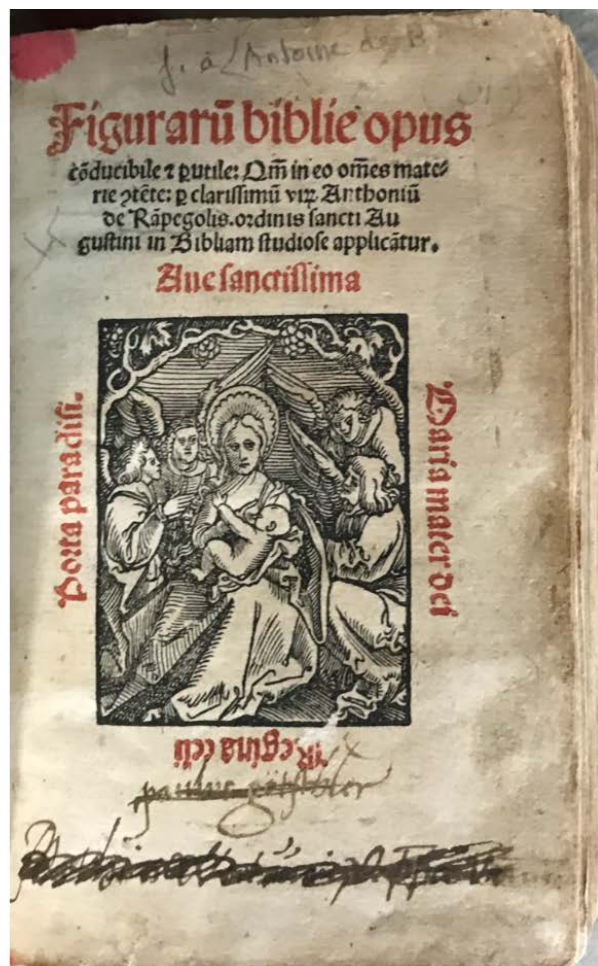
[6] [Bible] RAMPEGOLLO